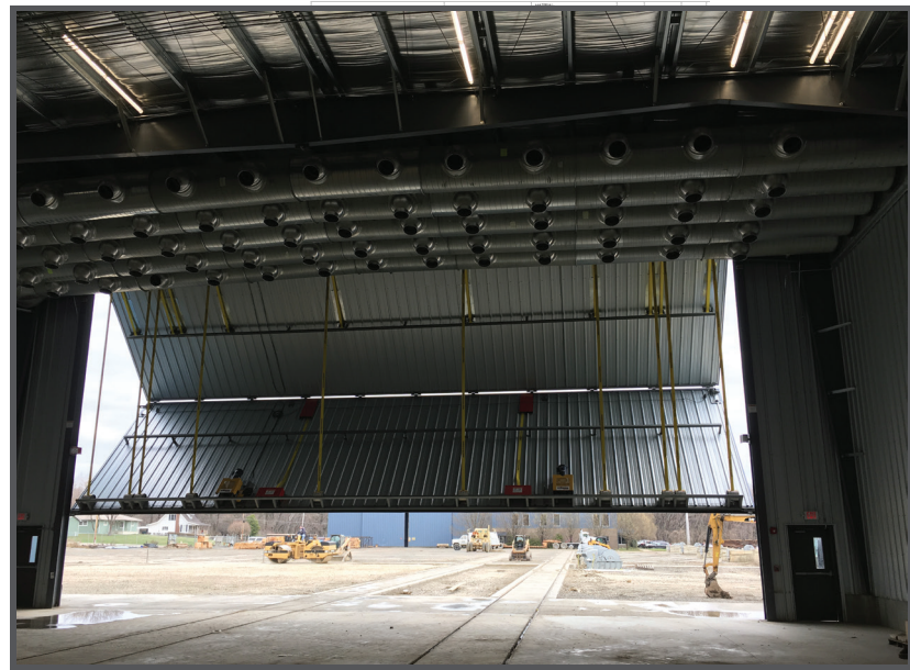
Completed blast and paint hall with directional air nozzles shown