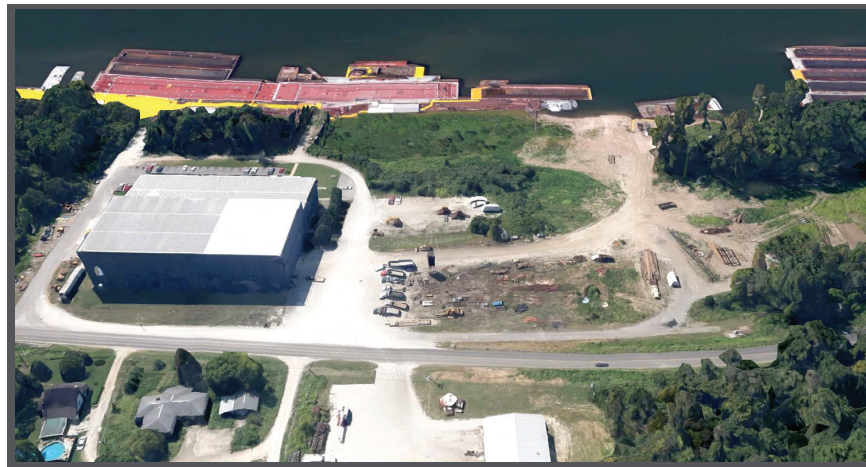
Aerial view of Superior Marine's facility site before construction

Superior Marine wanted to roll out the ability to blast and paint barges indoors as an additional service in their river barge business sector.