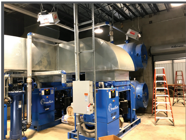
BlastOne's scope included a complete compressed air plant capable of producing 2500CFM at 150PSI

The facilities were outfitted to serve both functions to drive down initial costs for the company.