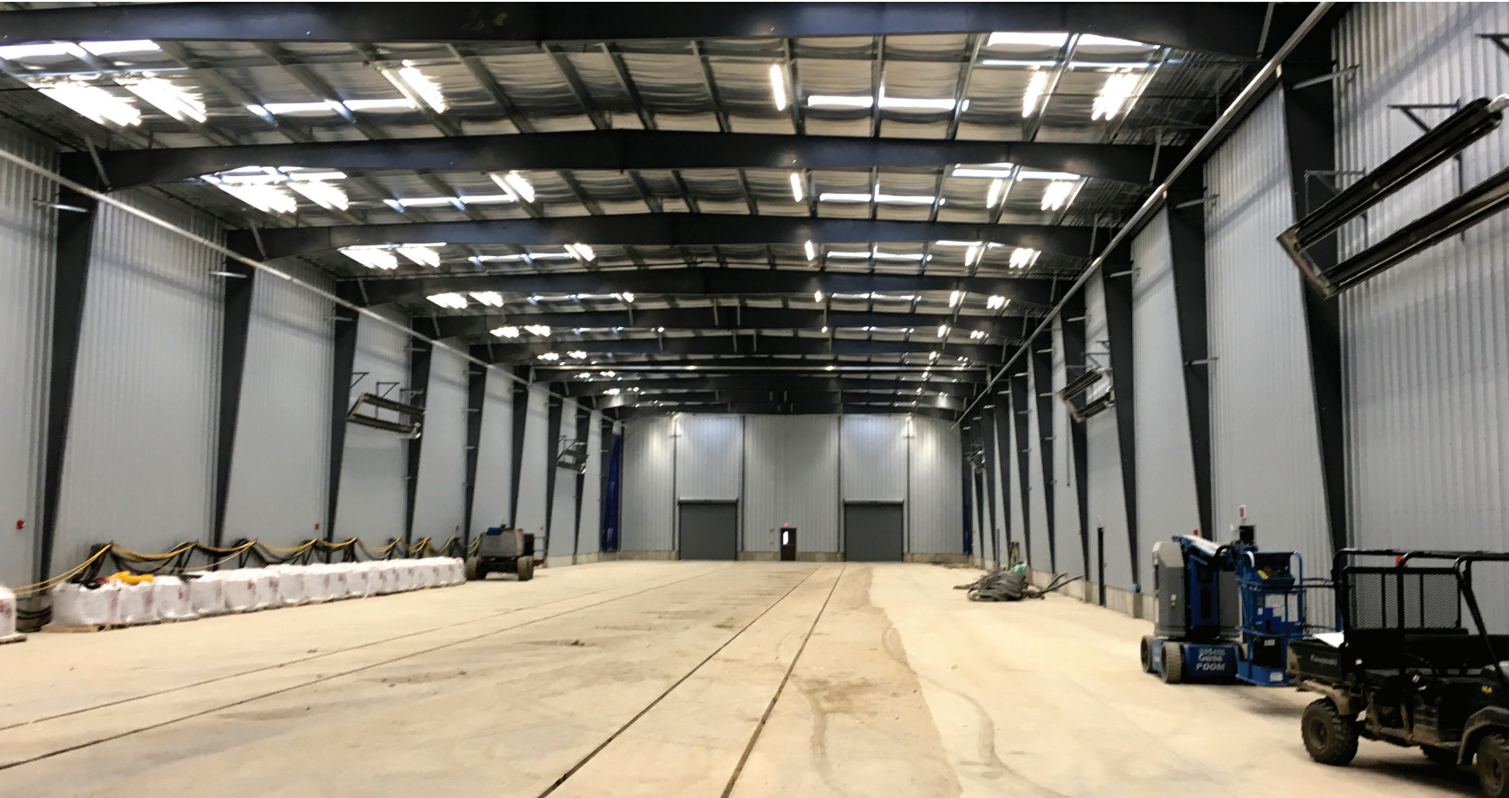
Finalized finishing facility designed with space for an entire barge during the finishing process